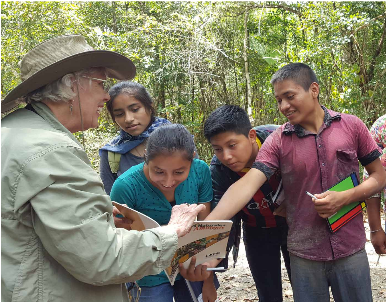
Young people in Calakmul, Mexico work with global mahogany expert; learn about her lifelong journey with this iconic tree species; and conduct field experiments to identify saplings, measure adult trees, and estimate seed production.

Through a partnership with the Rainforest Alliance, the youth of Calakmul are deepening their connection to their community, ecosystem, and cultural heritage which in turn helps with improved self-worth and, ultimately, community cohesion. Our work helps these young people gain a greater desire to stay and create a better—more sustainable—future for their community.