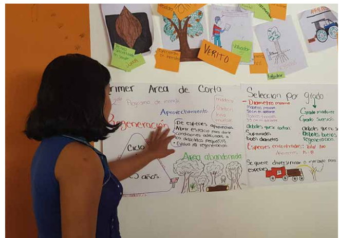
Youth participants analyze the process of sustainable forest management and the careers and opportunities available in each step of the forestry value-chain.

of potential career opportunities in the region. For example, during one recent workshop, students had the opportunity to spend time with a leading global expert in mahogany research. The expert shared her personal scientific journey with the group and how she came to make a career of studying the mahogany tree. She also noted that very little information is known about the many tree species in the region, and more local scientific studies are needed to fill in critical gaps in information. She encouraged our young participants to embark on some of these studies. Together we designed a number of practical activities our group could complete to get more deeply acquainted with the mahogany tree. Students spent the day identifying and counting mahogany saplings in a research plot; looking for parts of the mahogany fruit to determine how many seeds and fruit one tree would produce; and taking tree measurements to determine the size of the mahogany canopy. They learned about the process of conducting scientific research and together we discussed the application of such research in their community. Learning how different tree species grow, mature, and disperse seeds helps forestry operations determine when and where to plant new trees, how to collect and store seeds, among other uses. This is just one example of how experts have shared knowledge and their personal experiences to inspire our youth participants.