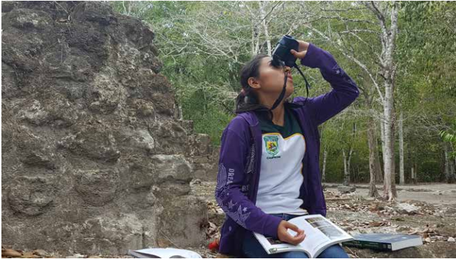
During a field visit to the Calakmul Biological Reserve, a student works on identifying local vegetation.

Aside from the intellectual loss, rural communities are also losing human capital; hands to help work the land, care for the young and old, and the day-to-day activities that keep the local economy running. The loss of young residents also negatively impacts the productivity of the local landscape and economy, meaning an older and aging workforce is left behind. An older labor force often means a decrease in productivity and an increase in the average retirement age of residents 9 . The aging of the labor forces can have some serious long-lasting environmental consequences, especially in agricultural communities, such as shorter fallow periods which can lead to decreased soil fertility and crop yields 10 .