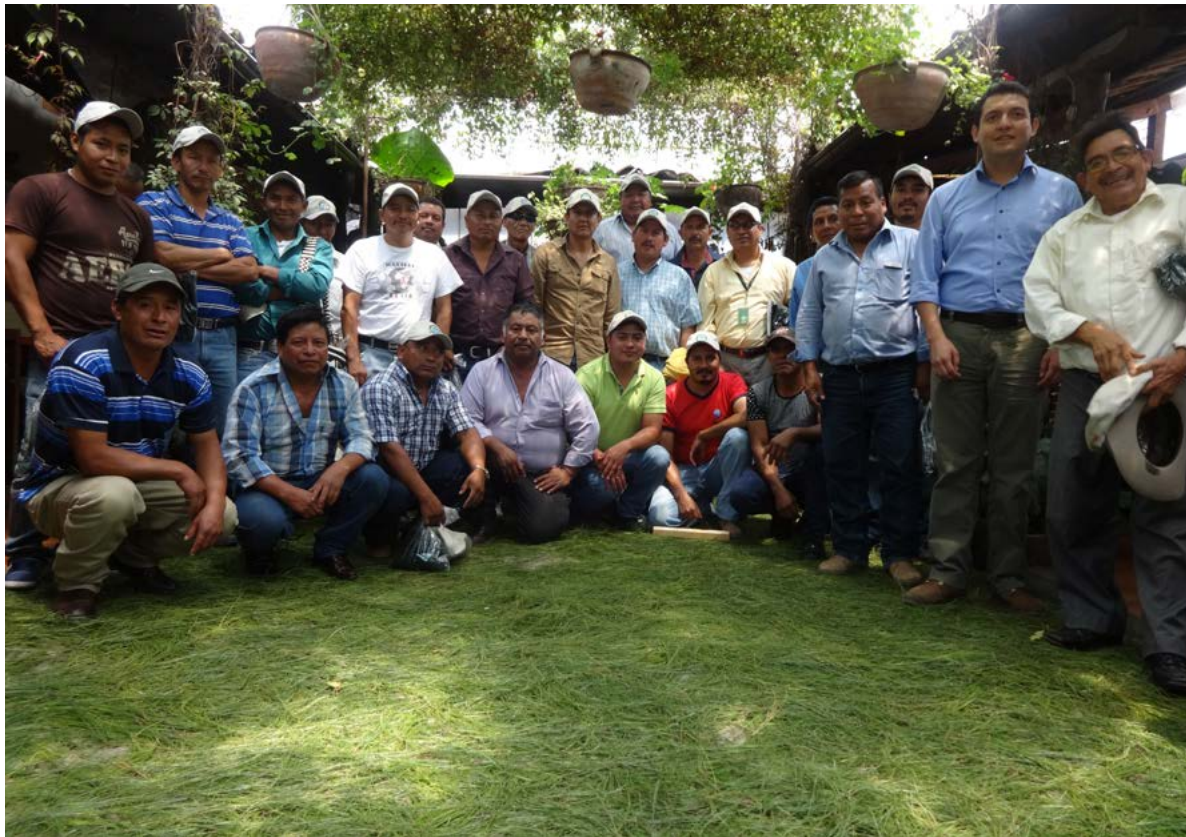
AFORQ was created in 2002 to support sustainable forest management and enterprise.

Anticipating these needs, the Quiché Forestry Association (AFORQ) was founded in 2002. The association's objective is to support responsible forest management in order to protect, conserve, and expand forest cover in Quiché. AFORQ presently consists of 28 members whose activities in this sector range across the value chain, from tree nursery operators to reforestation specialists, and from silviculturalists to wood buyers and sawmill operators. While a majority of AFORQ's members are forest owners themselves, not all are. They are unified by their efforts to provide services to a growing number of smallholder forests across Quiché. By the middle of 2016, AFORQ's members were involved in