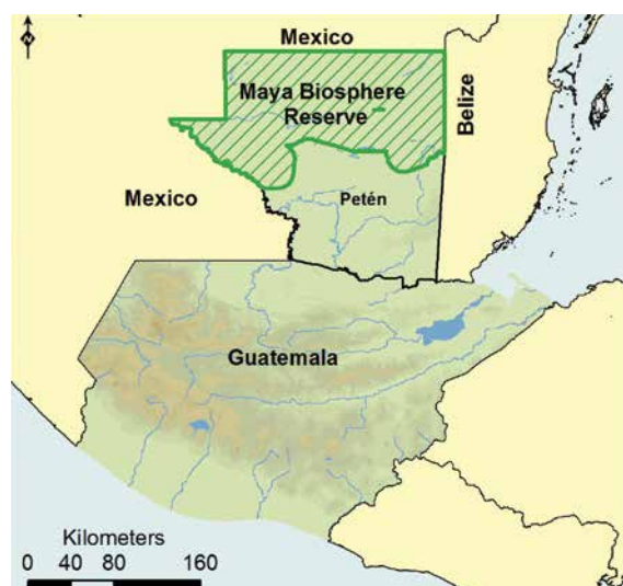
Map 1 Location of the Maya Biosphere Reserve, in the Guatemalan department of Petén