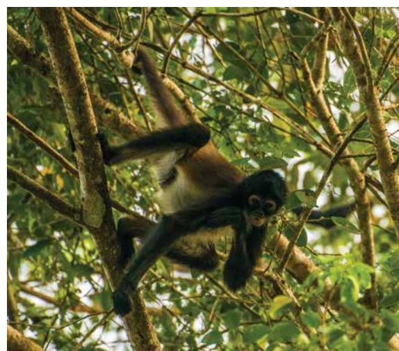
The MBR's concessions are home to an array of wildlife, such as this spider monkey

In the first few years after its founding FORESCOM obligated members to sell a certain amount of