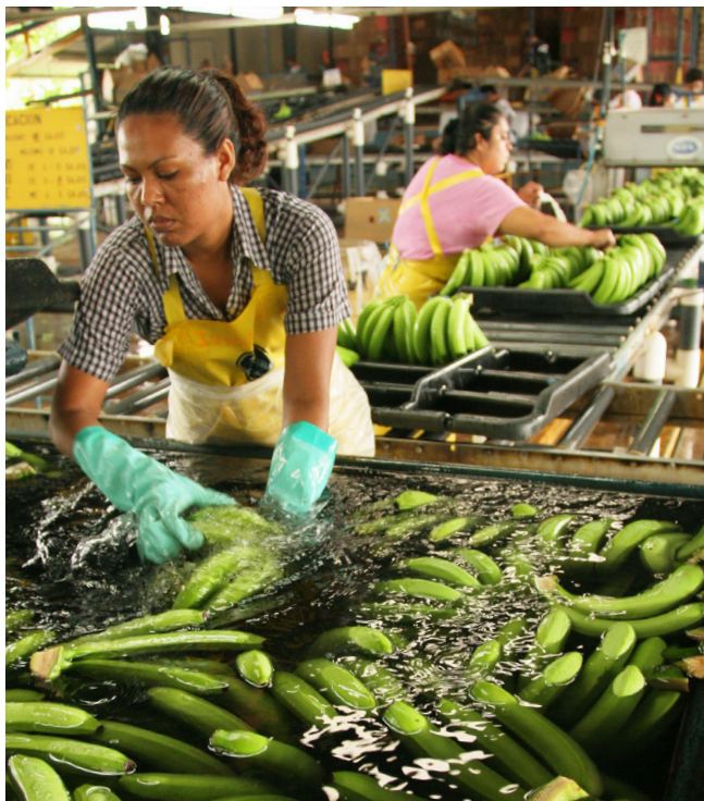
Workers wash and pack bananas on a Rainforest Alliance Certified farm operated by Chiquita.

The Rainforest Alliance Certified™ seal is an internationally recognized symbol of high standards. We are a member of the ISEAL Alliance , a membership organization for sustainabil-