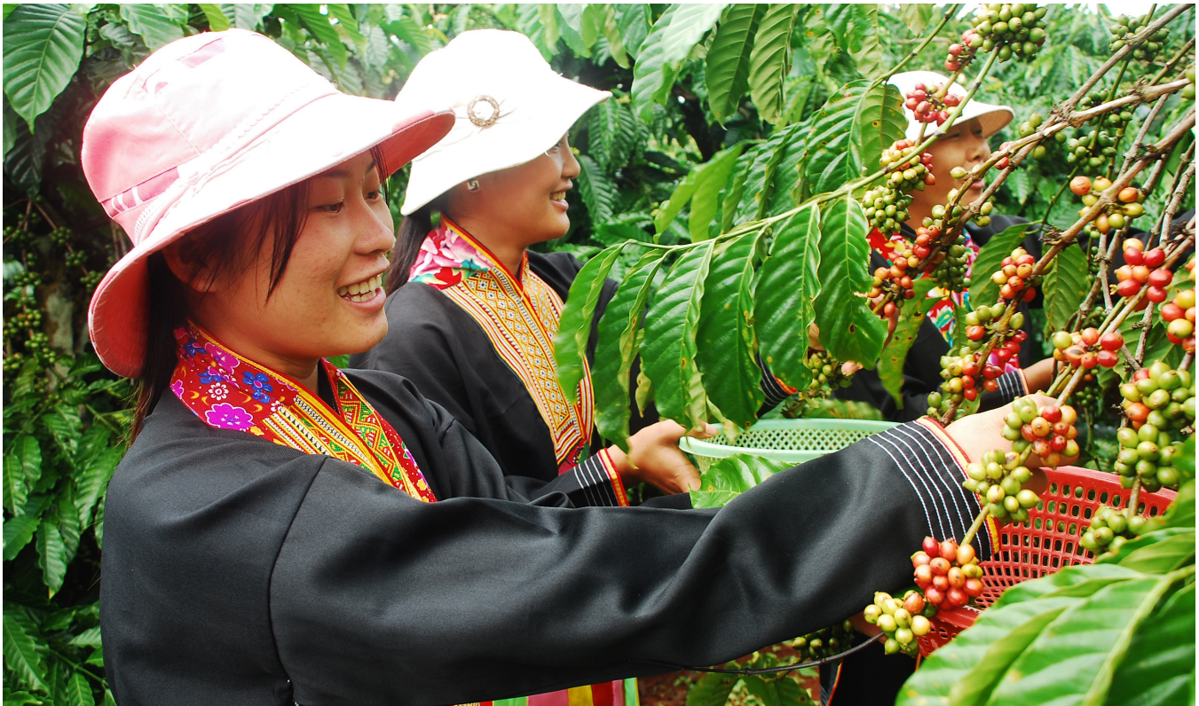
Workers on a Rainforest Alliance Certified farm in Vietnam pick coffee cherries.

ity standards, which sets the criteria against which the Rainforest Alliance must operate both in standard setting as well as in providing assurance.