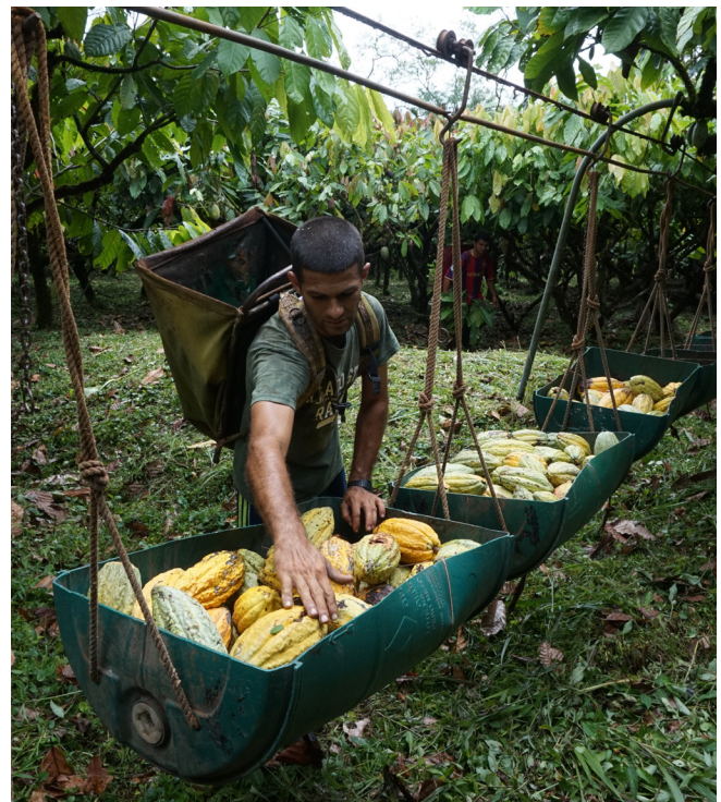
Harvesting cocoa pods on a Rainforest Alliance Certified farm in Costa Rica.