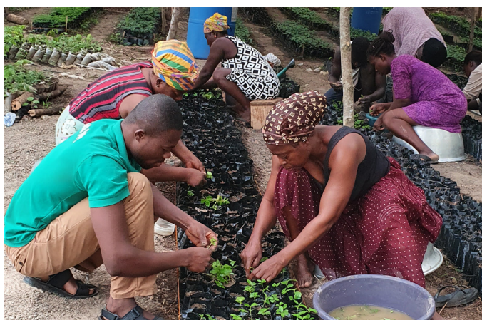
Cocoa farmers planting tree seedlings to restore tree cover and build climate resilience in the Sui-River landscape of Ghana.

Help us reach more landscapes and communities and drive impact by becoming a partner.